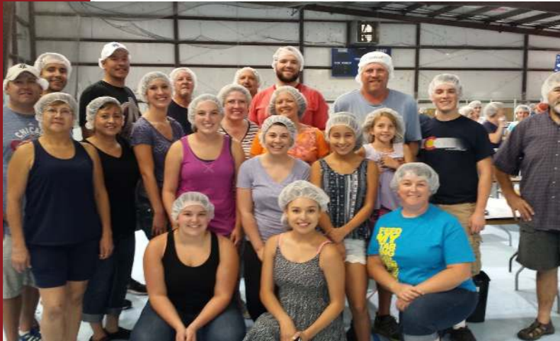
Dodrill Insurance staff working a packing event at the Daniel L. Schaefer Athletic Complex near Hampden and Kipling

For more information about Feed My Starving Children, visit www.fmssc.org .